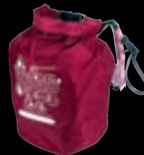
Optional emergency "Over 24 hours" pack, available inside the canister for 6 persons Ocean Liferaft only**