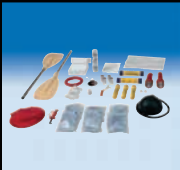
Over 24 hours Emergency Pack, contained in optional grab bag